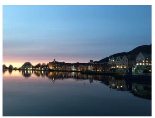
View from the fish market in Bergen.

ful conference dinner at Matbørsen. When the papers had been wrapped up, the ASNCs were rewarded with a tour of the splendid royal hall, Håkonshallen, and its environs. Bergen was blessed with rare sunshine for the entire symposium, and this made the trip all the more memorable.