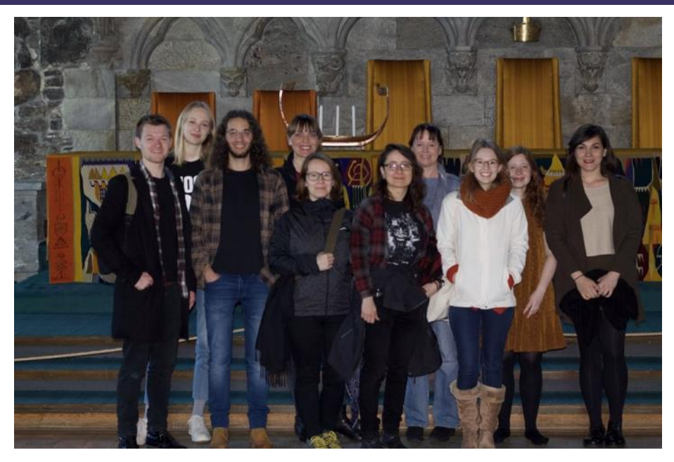
The Cambridge contingent in Bergen, at Håkonshallen.